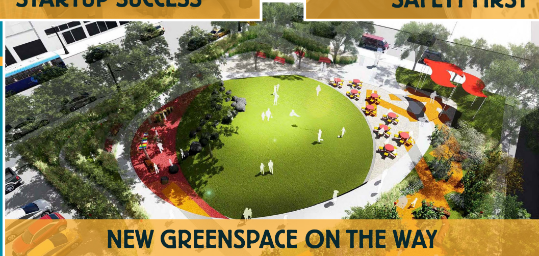
NEW GREENSPACE ON THE WAY