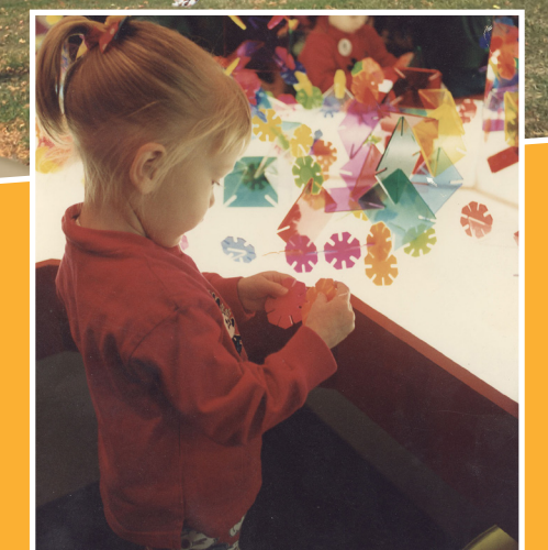
Expected to open next year, the Gilchrist Learning Center will foster even more hands-on experiences at the Sioux City Art Center.