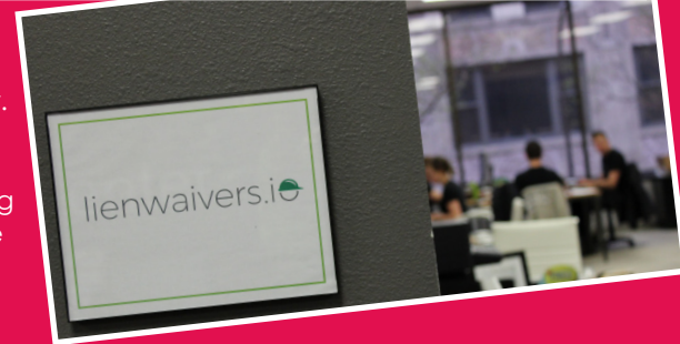
RIGHT: Springboard Coworking has been an ideal workspace for lienwaivers.io.

lienwaivers.io, an up-and-coming technology startup, is building quite a name for itself in Sioux City and beyond.