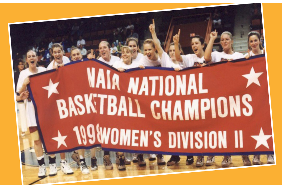
Walsh University took home first-place honors when our community first hosted the NAIA Women's Division II National Championship at the Sioux City Auditorium in 1998.

Playing host to the National Association of Intercollegiate Athletics (NAIA) Division II Women's Basketball Championship for 20 years has given Sioux City a wealth of memories. Here are 10 highlights that really stand out.