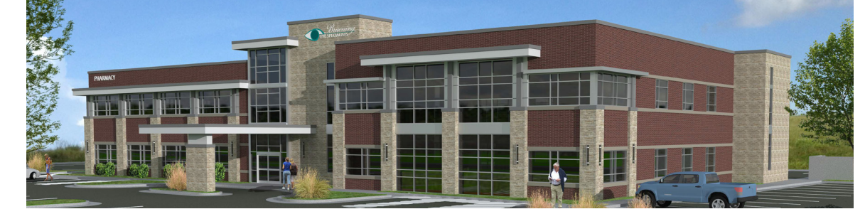
Sunnybrook Center will expand the medical campus in this growing segment of Sioux City.

As additional medical, residential, and retail opportunities take shape, Sunnybrook remains one of the most popular areas of Sioux City.