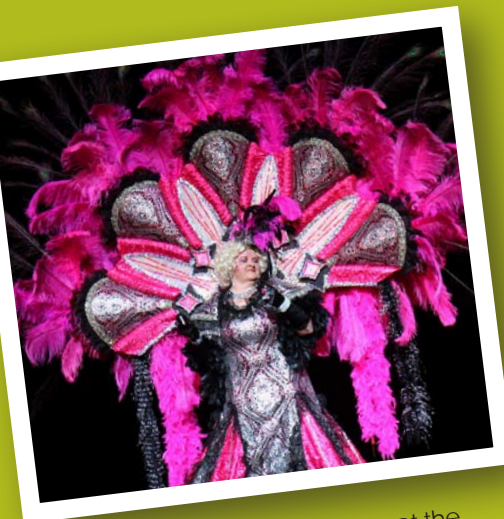
The large costumes and feathers at the Mardi Gras gala are designed and made by Krewe members from Lake Charles, La.