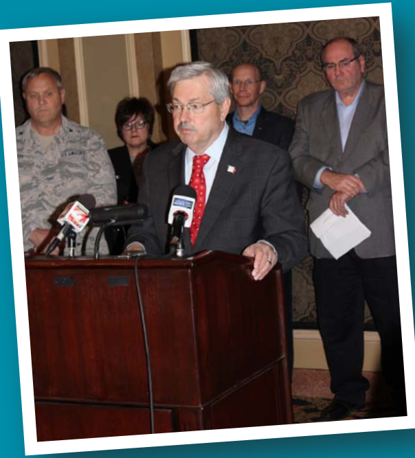
In late April, Iowa Gov. Terry Branstad honored Sioux City as a Home Base Iowa Community and recognized its initiatives to attract job-seeking veterans.

As a Home Base Iowa Community, Sioux City offers many incentives for veterans and their families. Visit locatesiouxcity.com/workforce for a complete listing.