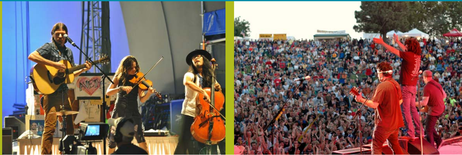
Saturday in the Park draws 30,000 fans to its annual festival, which brings in top-notch bands like The Avett Brothers (left) and Counting Crows (center). Aretha Franklin (right) headlines this summer's event.