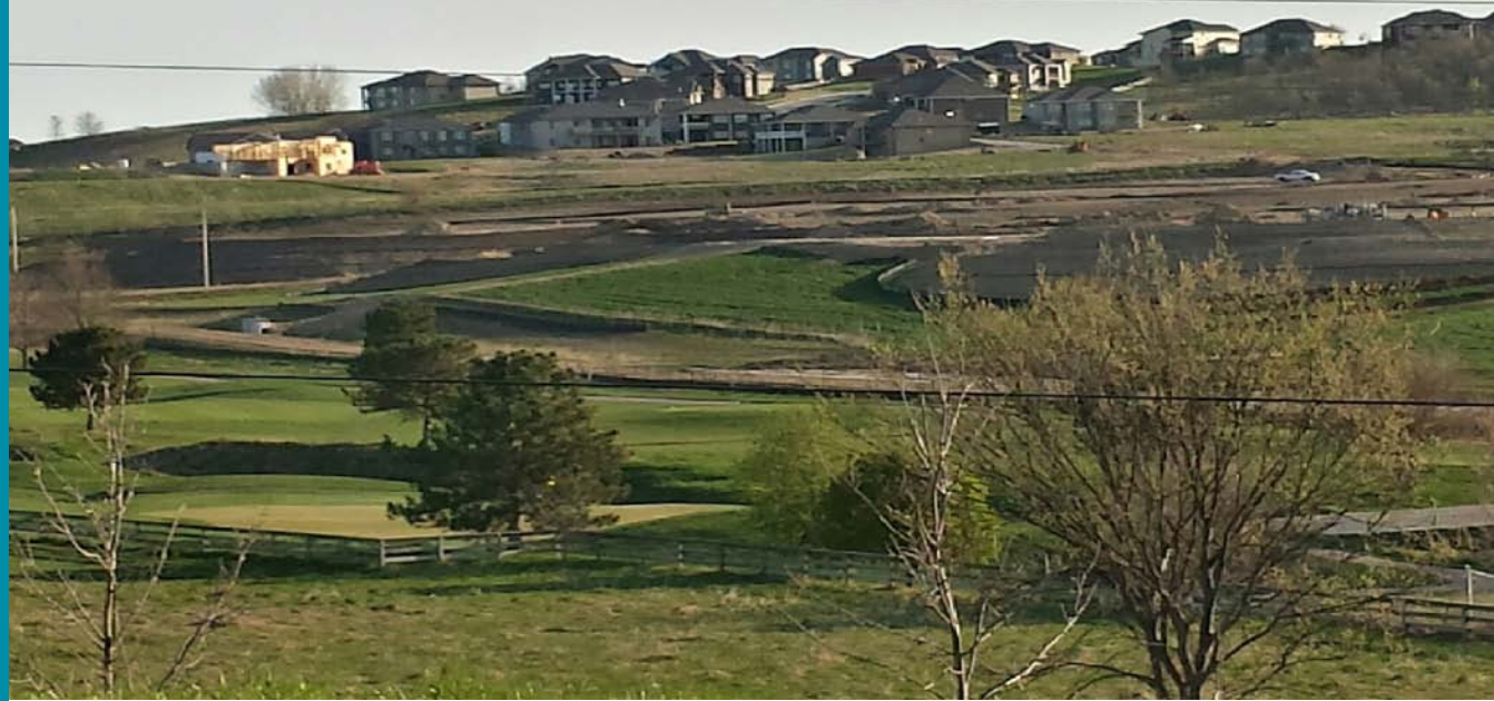
The community's increased housing demand has led to a variety of new developments throughout Sioux City.