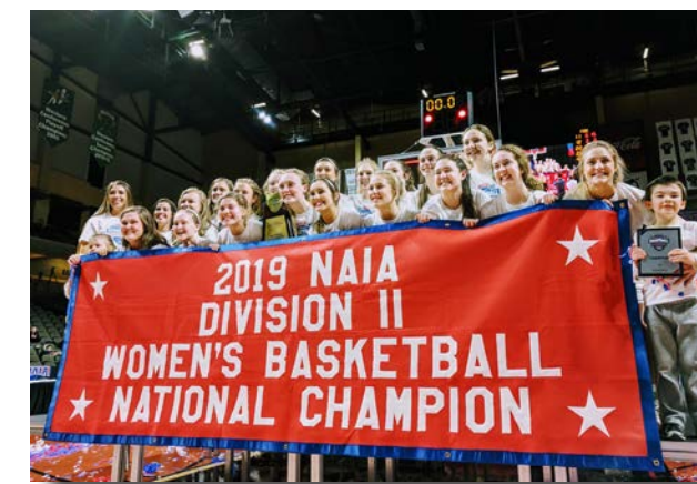
Marking a 22-year run, Sioux City is currently the longest active host of NAIA annual championships!