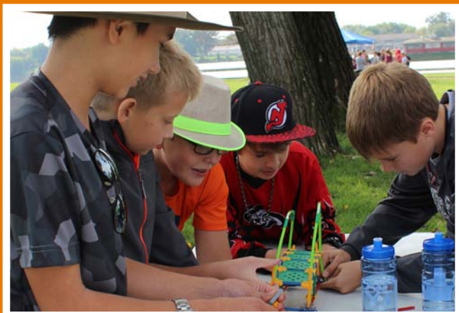
STEM IN ACTION