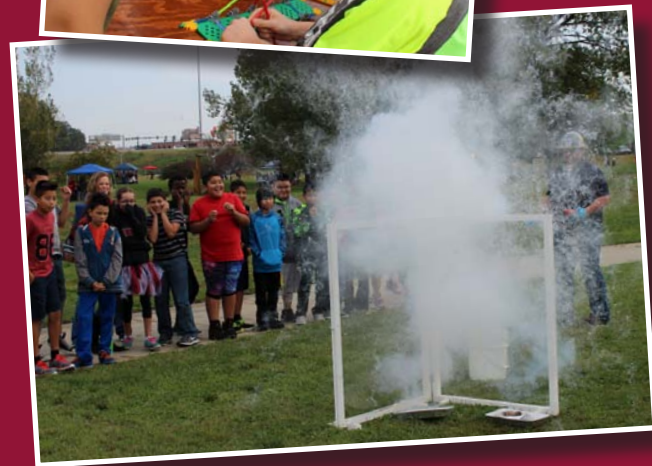
Area students explored science, technology, engineering, and math through hands-on experiences at a city-sponsored event this fall.