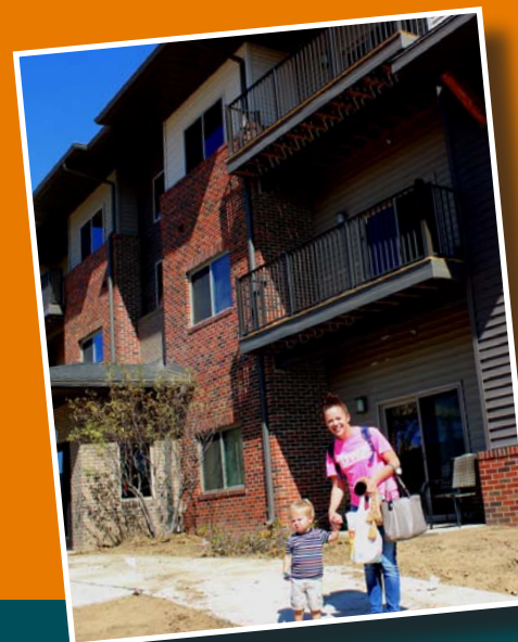
New construction is popping up all over the community, including The Summit at Sunnybrook Village on Sioux City's east side.