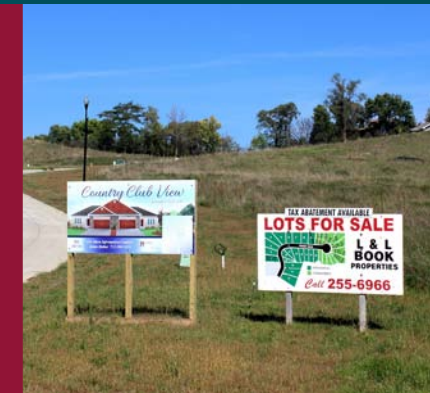
Sioux City has seen growth in all facets of the housing market, including single-family homes, upscale condos, affordable townhomes, and apartment rentals.