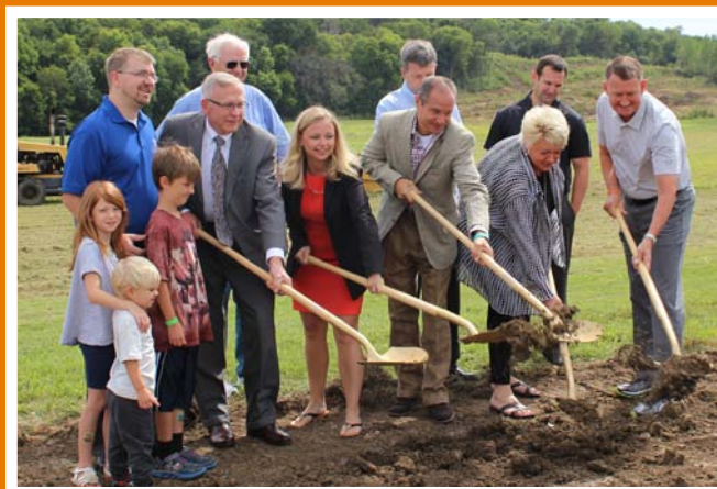
FUN FOR ALL SEASONS