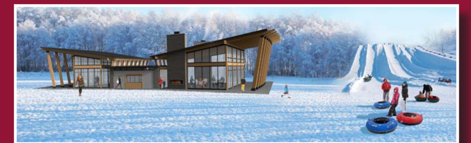
Cone Park construction began late last summer and should finish by next winter.