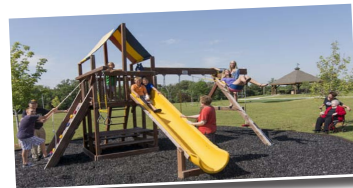
The playground at Sunrise prompts intergenerational ties.